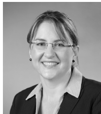
Hon Jacinta Allan MP Leader of the House Bendigo East