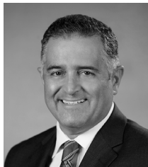
Hon Telmo Languiller MP Speaker of the Legislative Assembly (Chair) Tarnait