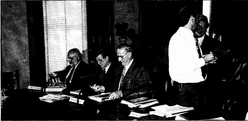
Minister for Planning and Local Government (Hon. R Maclellan), Minister for Transport (Hon. R Cooper) and Minister for Roads and Ports (Hon. G Craige) and departmental officers preparing for the Public Accounts and Estimates Committee public hearing on the budget estimates for their portfolios.