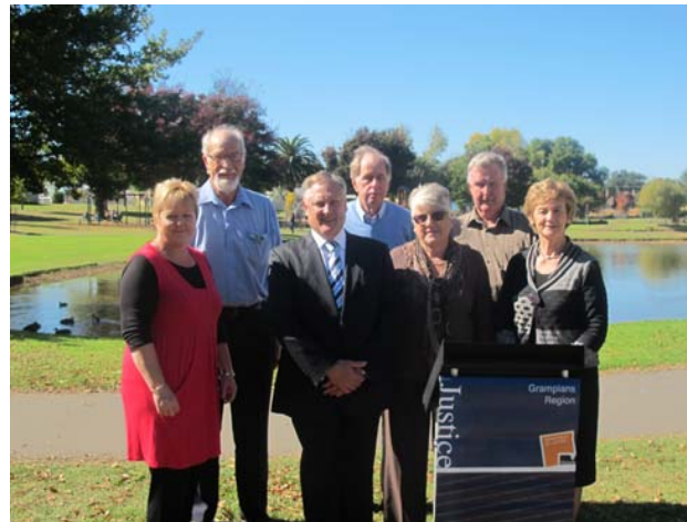
PSIF Announcement Launch held in Stawell 12/04/2012 and Chapel Street announcement held on 13/04/2012