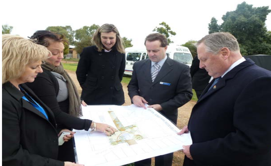
East End Community Project in Mildura