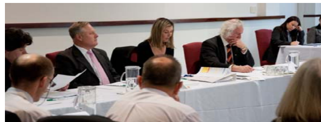
Inaugural Northern Crime Prevention Reference Group meeting in Mildura and inaugural Southern Crime Prevention Reference Group meeting in Bendigo