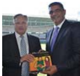
Launch of the AFL DVD to prevent violence against women and launch of the Victoria's endorsement of the National Plan to reduce Violence against Women and their Children.