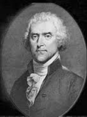
Thomas Jefferson 3rd U.S. President

When the people fear the government, there is tyranny. When the government fears the people, there is liberty.