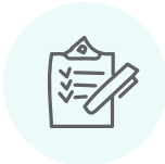
Total Matters Listed