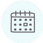
Average Per Day