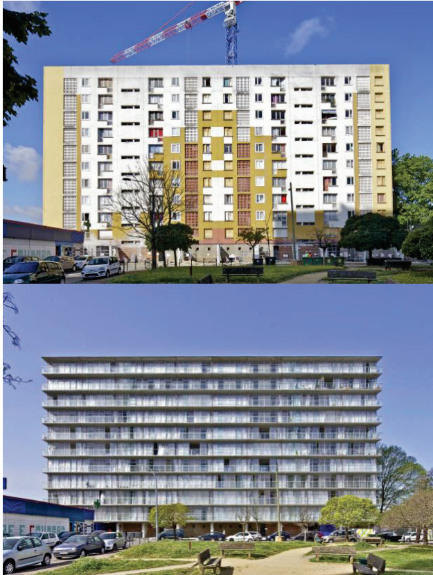
Before Retrofit (Top) and After (Bottom) Retrofit - Cité du Grand Parc, Bordeaux, France.