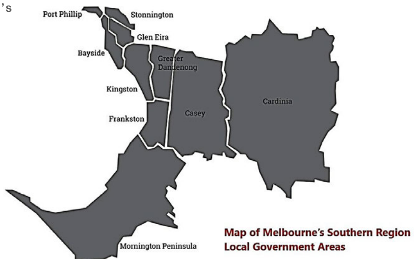
Figure 1 Map of Melbourne's Southern Region Local Government Areas

The Southern Region comprises ten local government areas in Southern Melbourne - Bayside, Cardinia, Casey, Frankston, Glen Eira, Greater Dandenong, Kingston, Mornington Peninsula, Port Phillip and Stonnington (see Figure 1). This is a geographically and socio-economically diverse region.