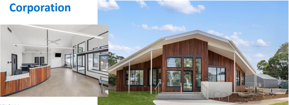
Winda-Mara Aboriginal Corporation