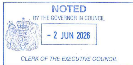
Sonya Kilkenny Attorney-General