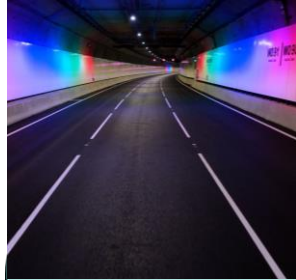
West Gate Tunnel