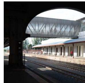
Ballarat Station Upgrade