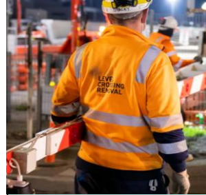
89 Level Crossing Removals