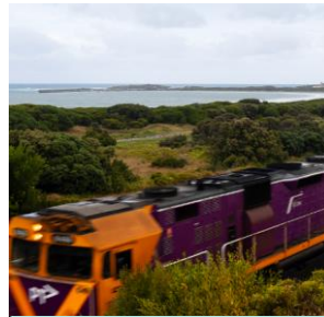
Warrnambool Line Upgrade