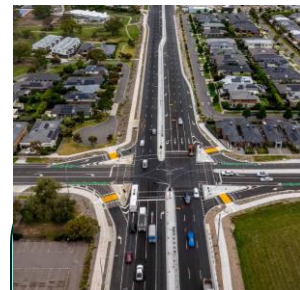
Epping Road Upgrade