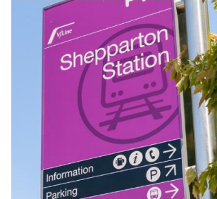
Shepparton Line Upgrade