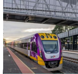
Gippsland Line Upgrade