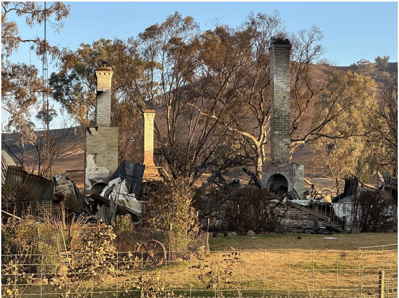
Residential property destroyed in the January 2026 bushfires, Yarck