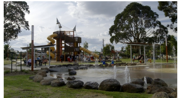
Hadfield Park Play Space, Mitchell Shire Council