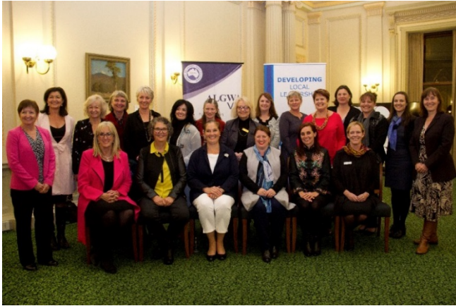
Participants of the 2017 ALGWA Women's Mayors Function at Parliament House