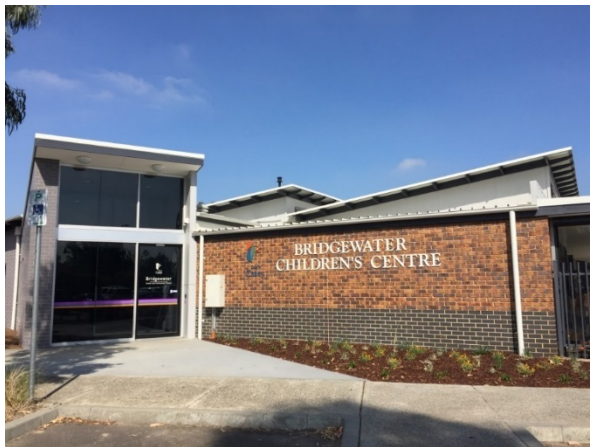
Bridgewater Family and Community Centre, City of Casey

The 2017-18 Budget builds on this success by investing a further $50 million over two years.