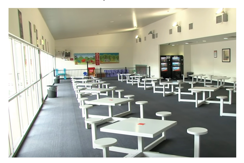
Figure 7.1 A visitor centre at a Victorian prison