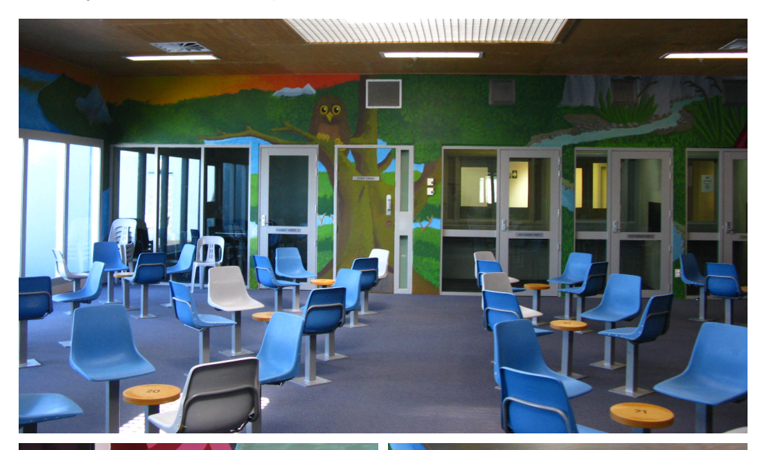
Figure 7.2 Kea Project Visitation Centre, New Zealand