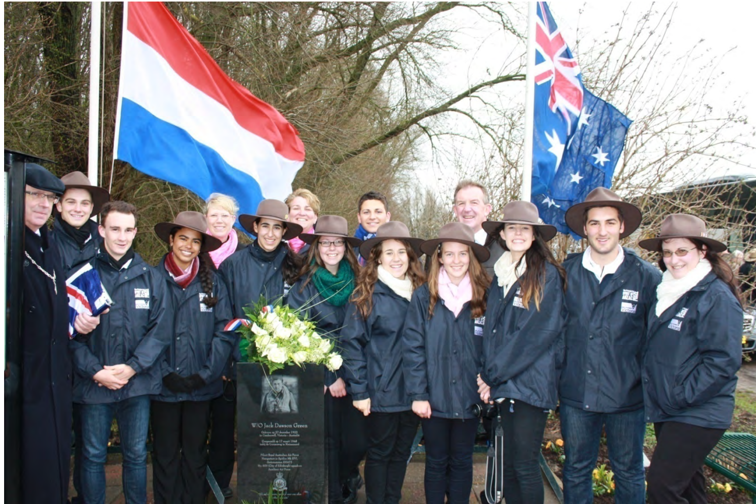
2013 Premier's Spirit of Anzac Study tour – the Netherlands