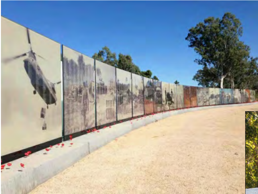
Seymour Vietnam Veterans Walk