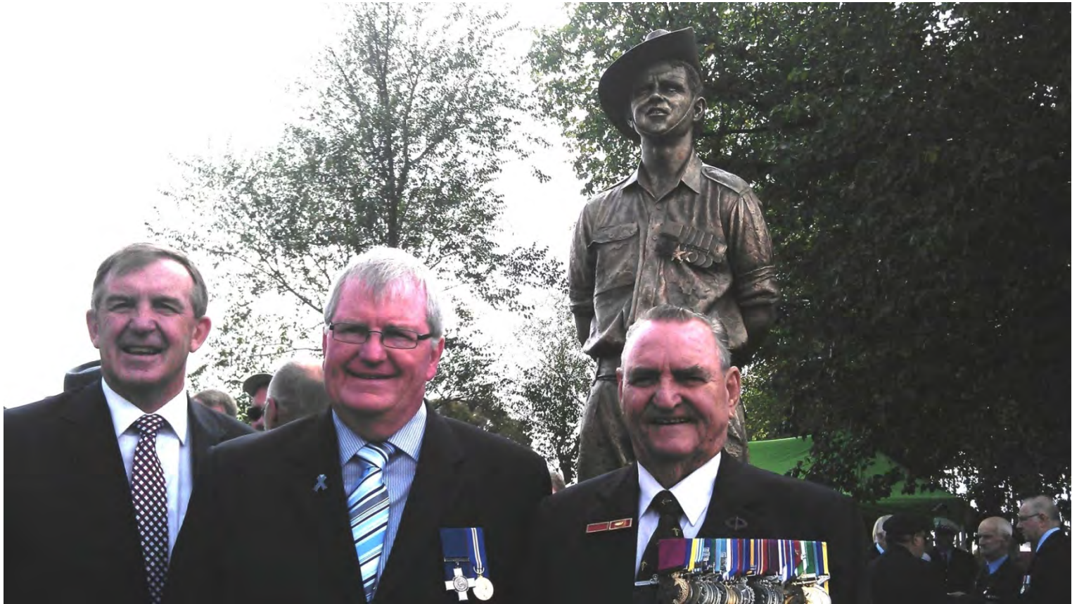
Unveiling of the Ted Kenna, VC, statue – Hamilton, April 2013