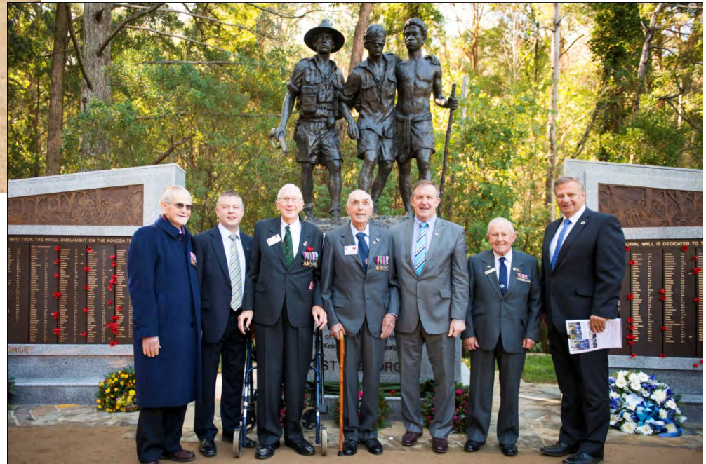
Kokoda Memorial Wall