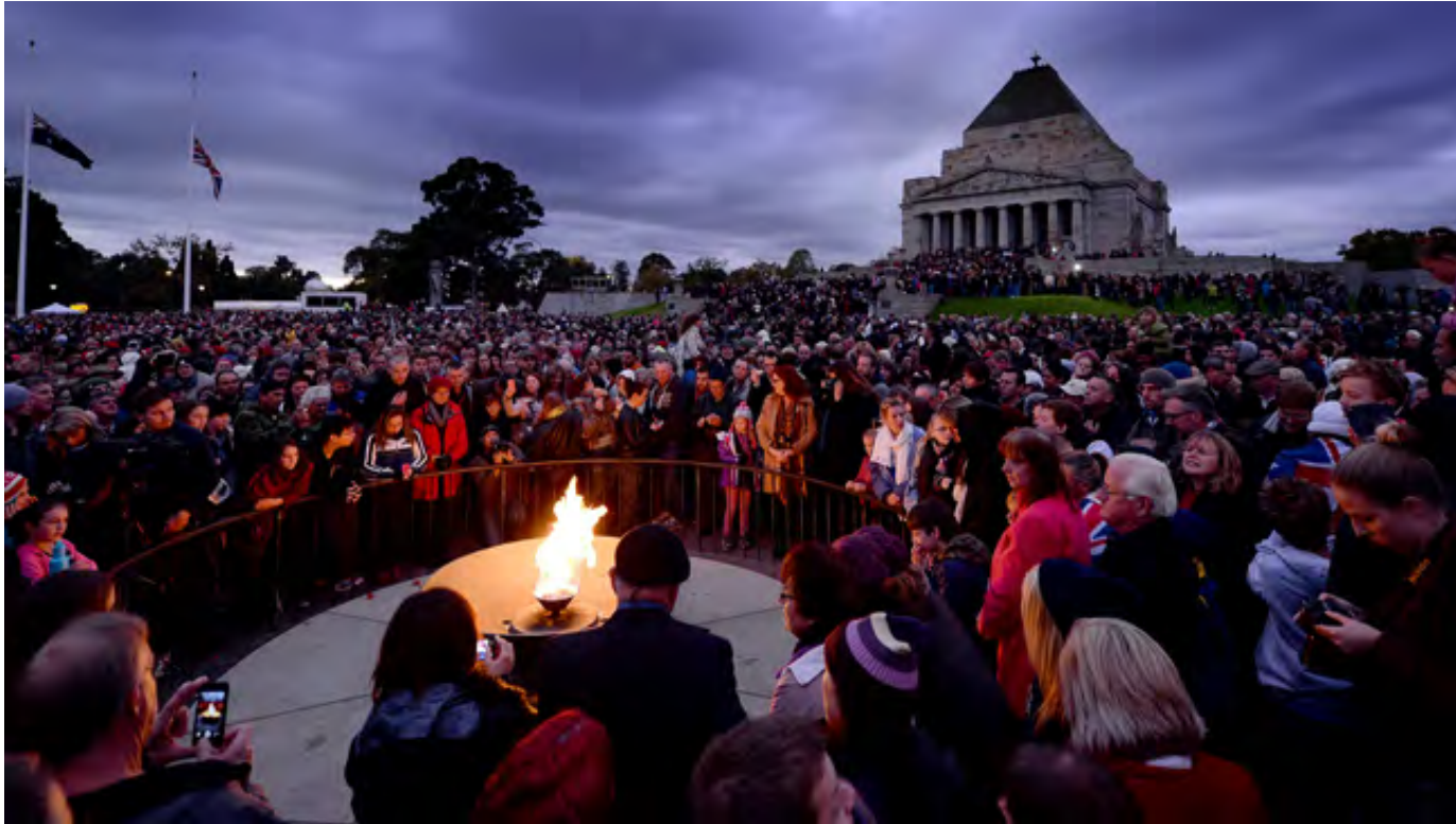
2013 Dawn Service, Shrine of Remembrance