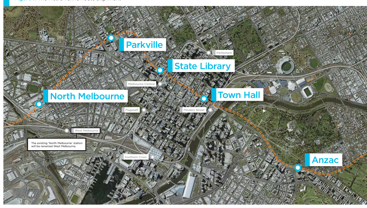
Figure 1: The Metro Tunnel route alignment