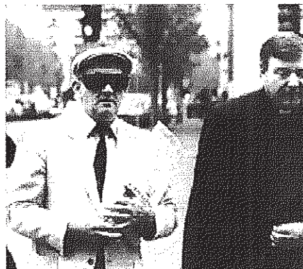
George Pell, right, then an auxiliary bishop in Melbourne accompanied by pedophile priest Gerald Ridsdale when the latter was facing charges in 1993.