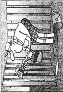
Improve your place - Page 21-23