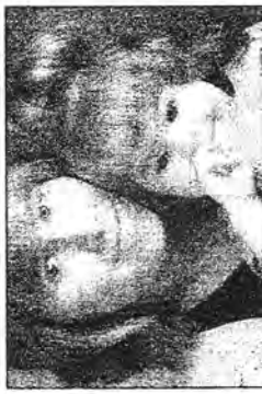
Searching for help - Page 14