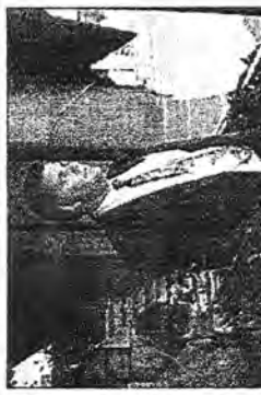
Office blast - Page 5