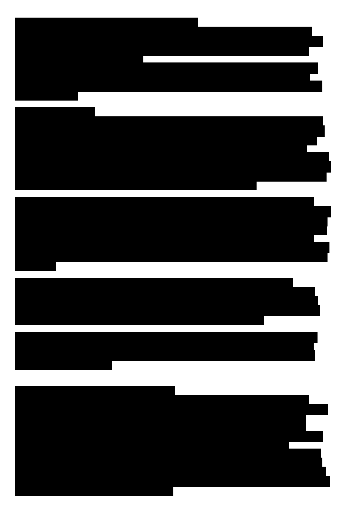
Further (final) submission to Inquiry into the handling of Child Abuse/ 7