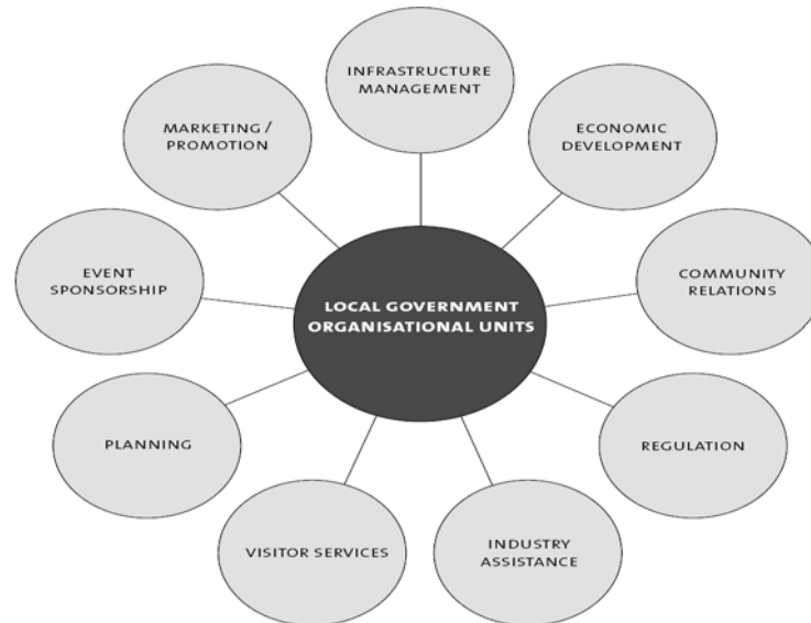
Figure 1: Some tourism related functions of local government (Tourism Alliance Victoria, 2005ii)

The following diagram (Figure 1) demonstrates the range of functions performed by local government that have implications for tourism either directly or indirectly.