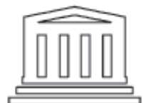
Aboriginal Representative Body

Aboriginal Representative Body to work with Victorian Government to establish the framework to support future Treaty negotiations