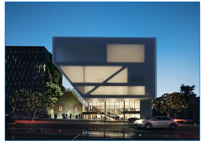
Geelong Performing Arts Centre