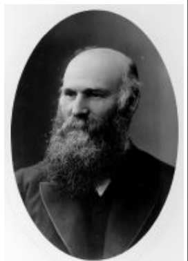
James Munro 1832–1908