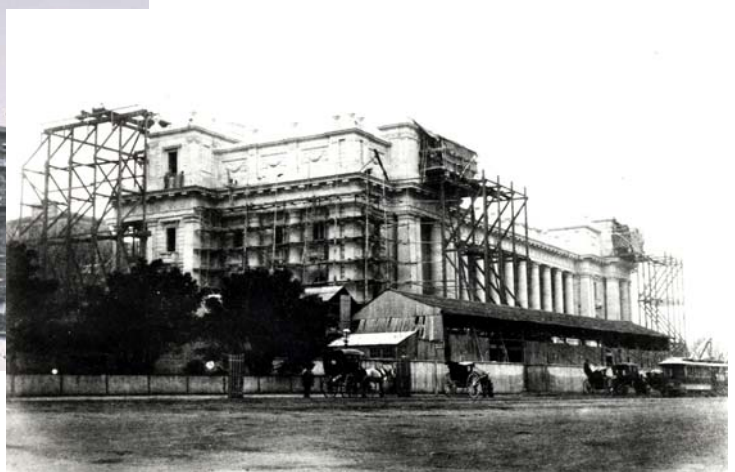
West façade under construction, c.1880