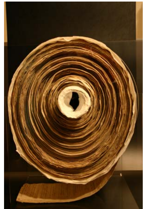
Women's Suffrage Petition, 1891

The teams of indexers from the Genealogical Society of Victoria and the Royal Historical Society of Victoria undertook the task of transcribing the names and addresses of the petitioners to be entered into a database. Scanned pages of the petition were provided on CD-Rom for the project. In some cases, deciphering the writing was a challenge and often the indexers resorted to tools such as phone books, street directories, Sands and McDougall directories as well as internet resources to try and decipher names and streets.