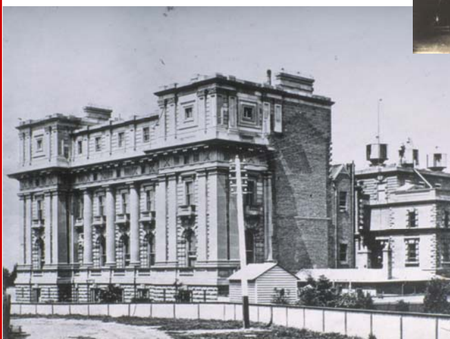
Eastern Wing façade, c.1870. The rear of the Council (left) and Assembly (right) can be seen.