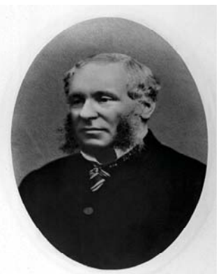
William Haines was Victoria's first Premier, he served between 1856-1857. Before becoming Premier William Haines was both a surgeon, in his native England, and a farmer.