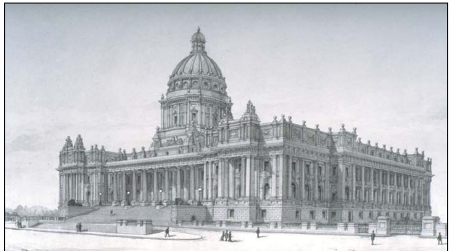
Just one of the many design sketches of the proposed Parliament House Building, including dome/cupola